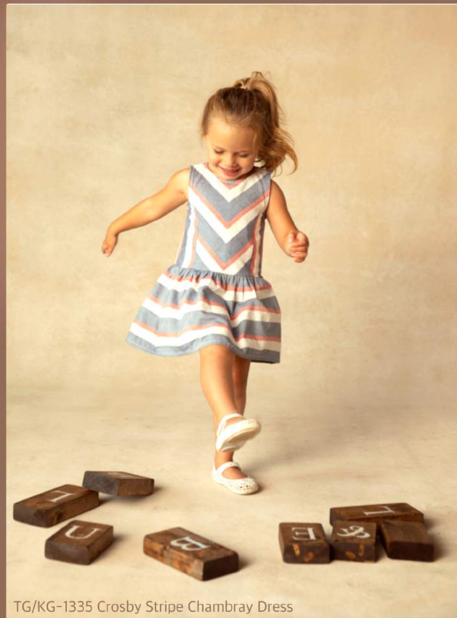
TG/KG-1335 Crosby Stripe Chambray Dress