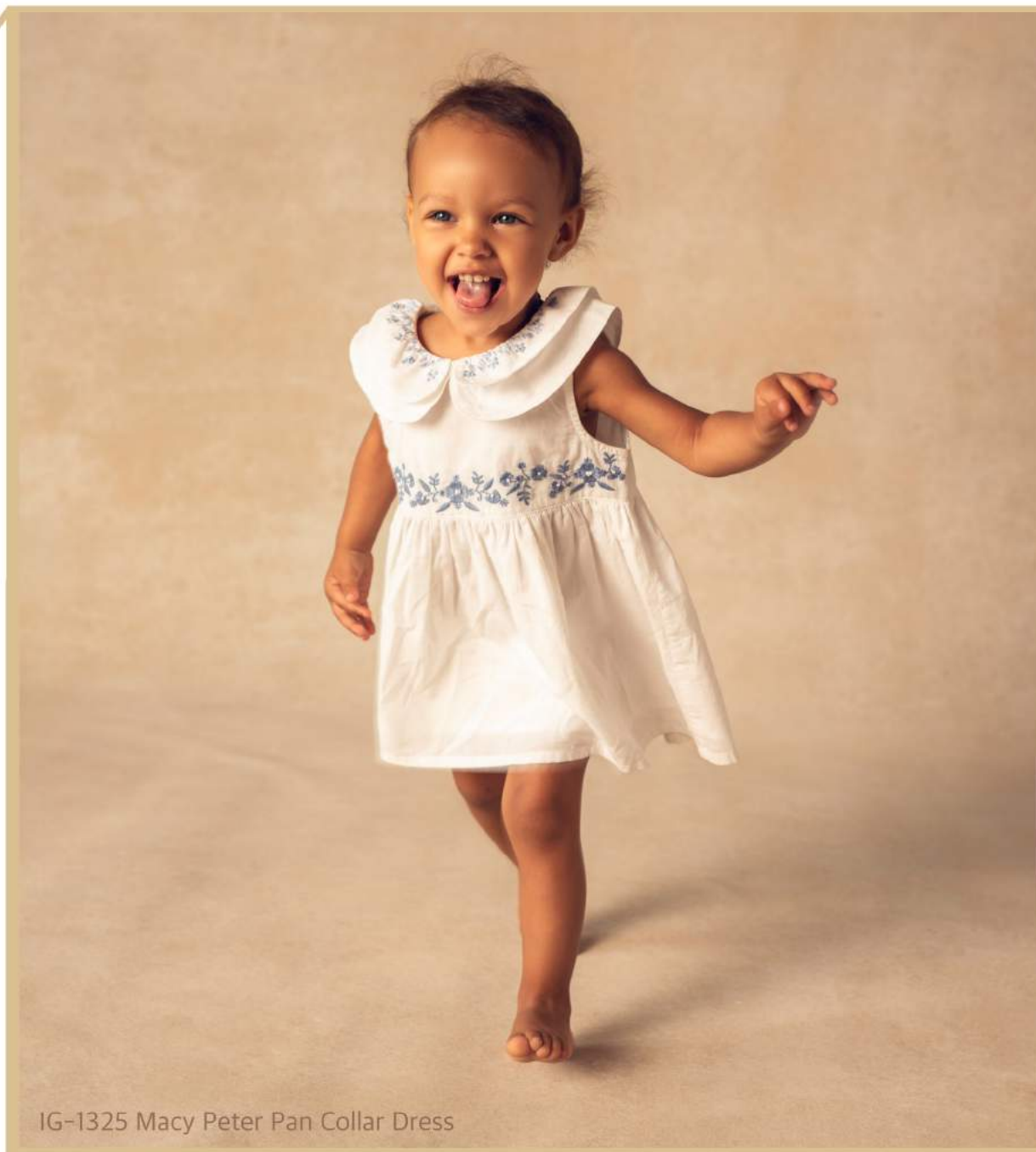
IG-1325 Macy Peter Pan Collar Dress