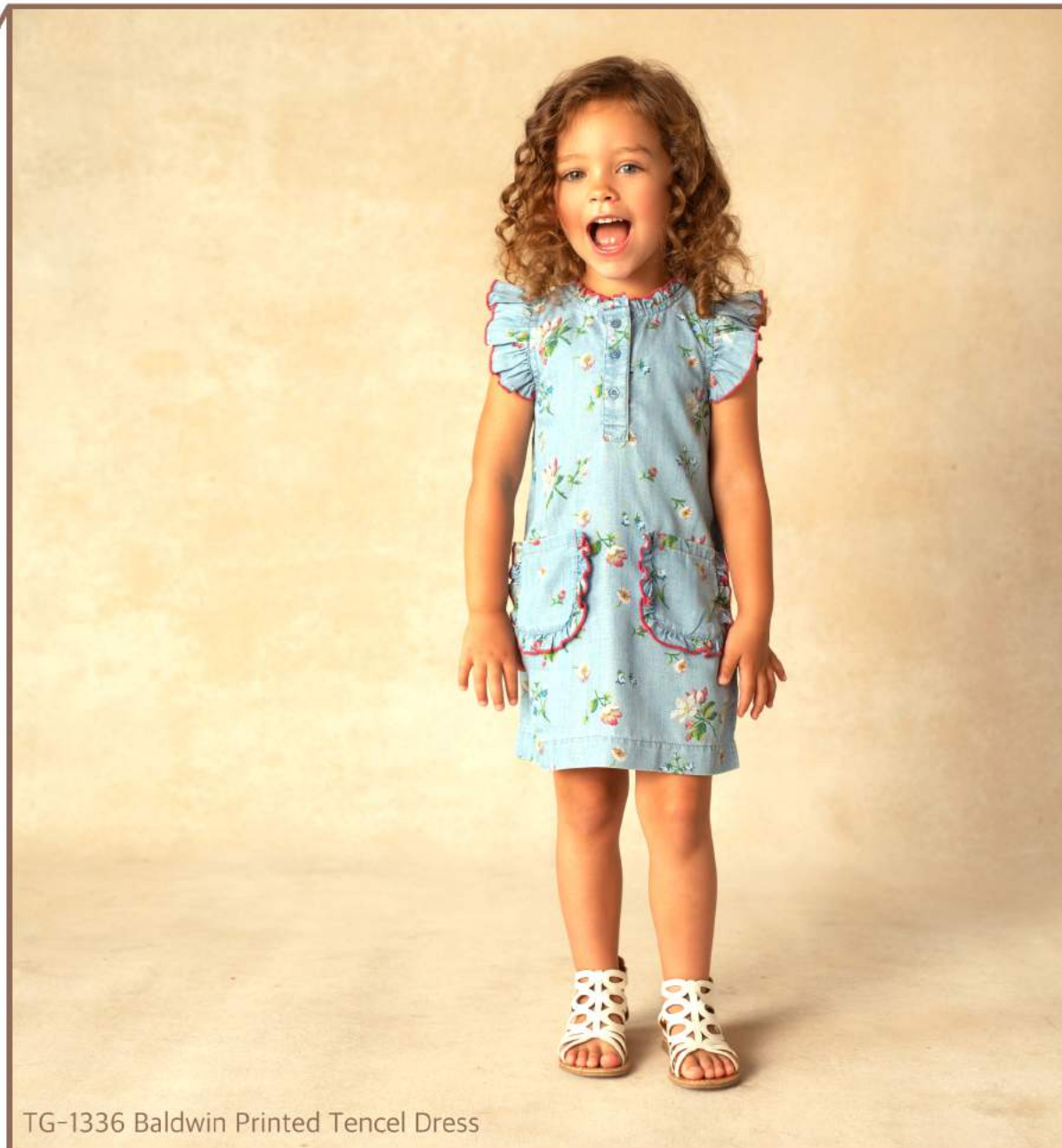
TG-1336 Baldwin Printed Tencel Dress