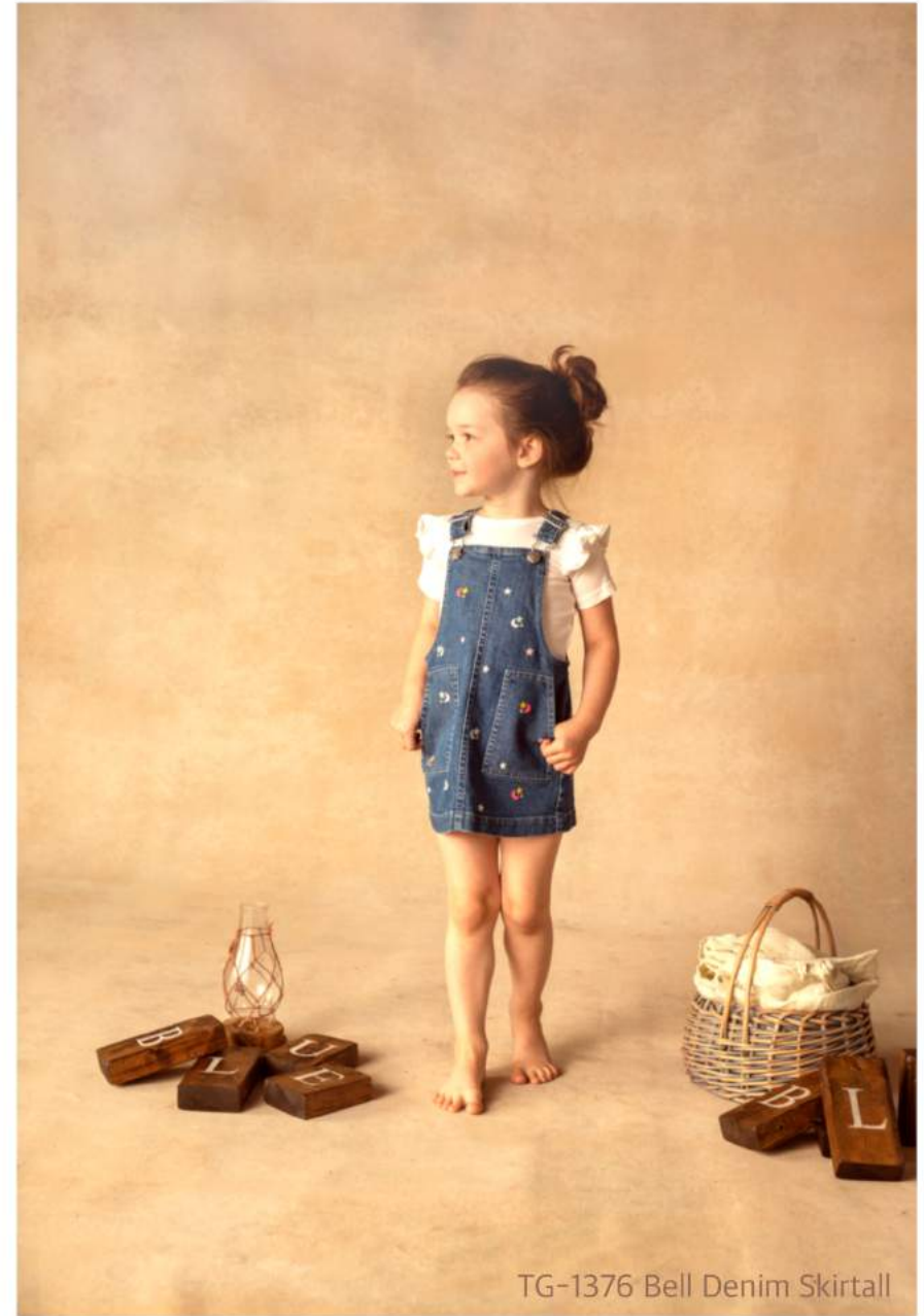
TG-1376 Bell Denim Skirtall