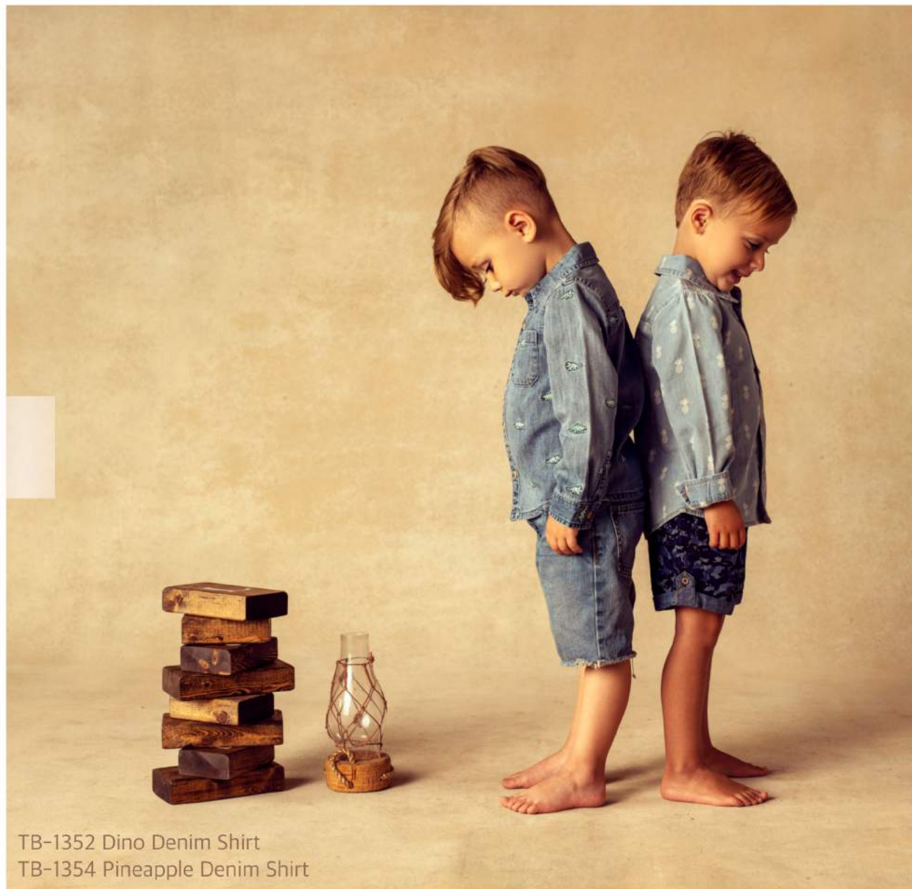
TB-1352 Dino Denim Shirt TB-1354 Pineapple Denim Shirt