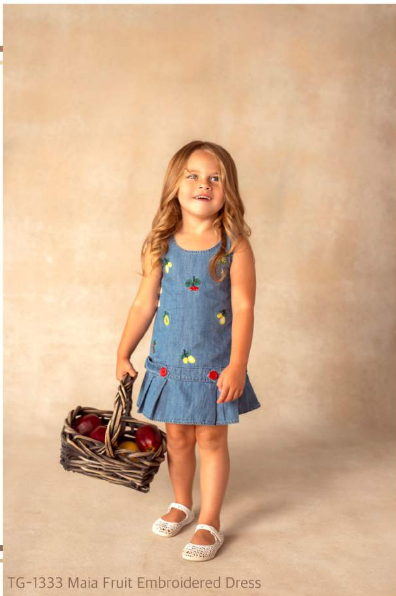
TG-1333 Maia Fruit Embroidered Dress