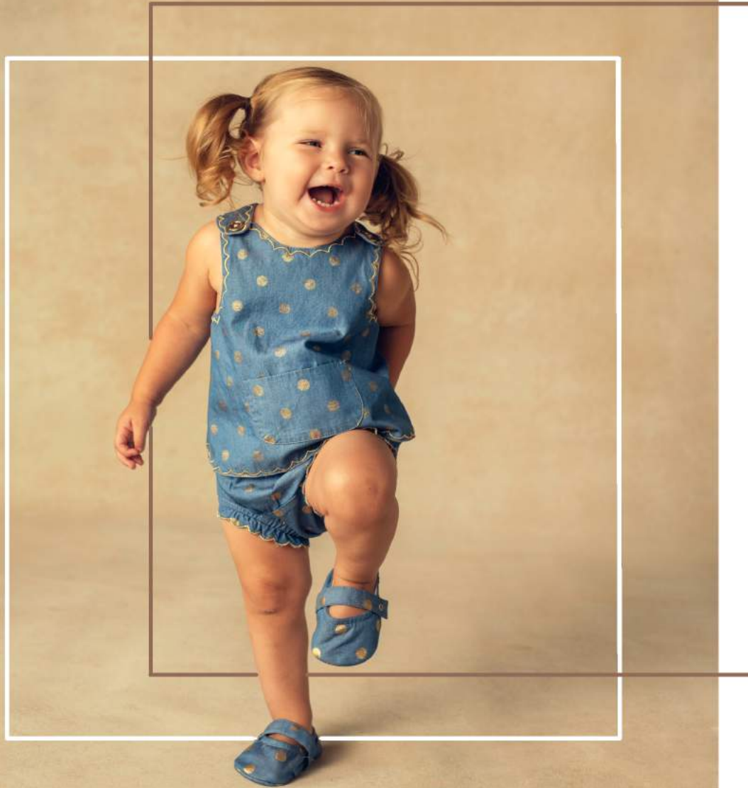
IG-1342 Mishka Gold Polka Dot Top IG-1362 Mishka Gold Polka Dot Bloomer SH-1438 Polka Dot Shoes