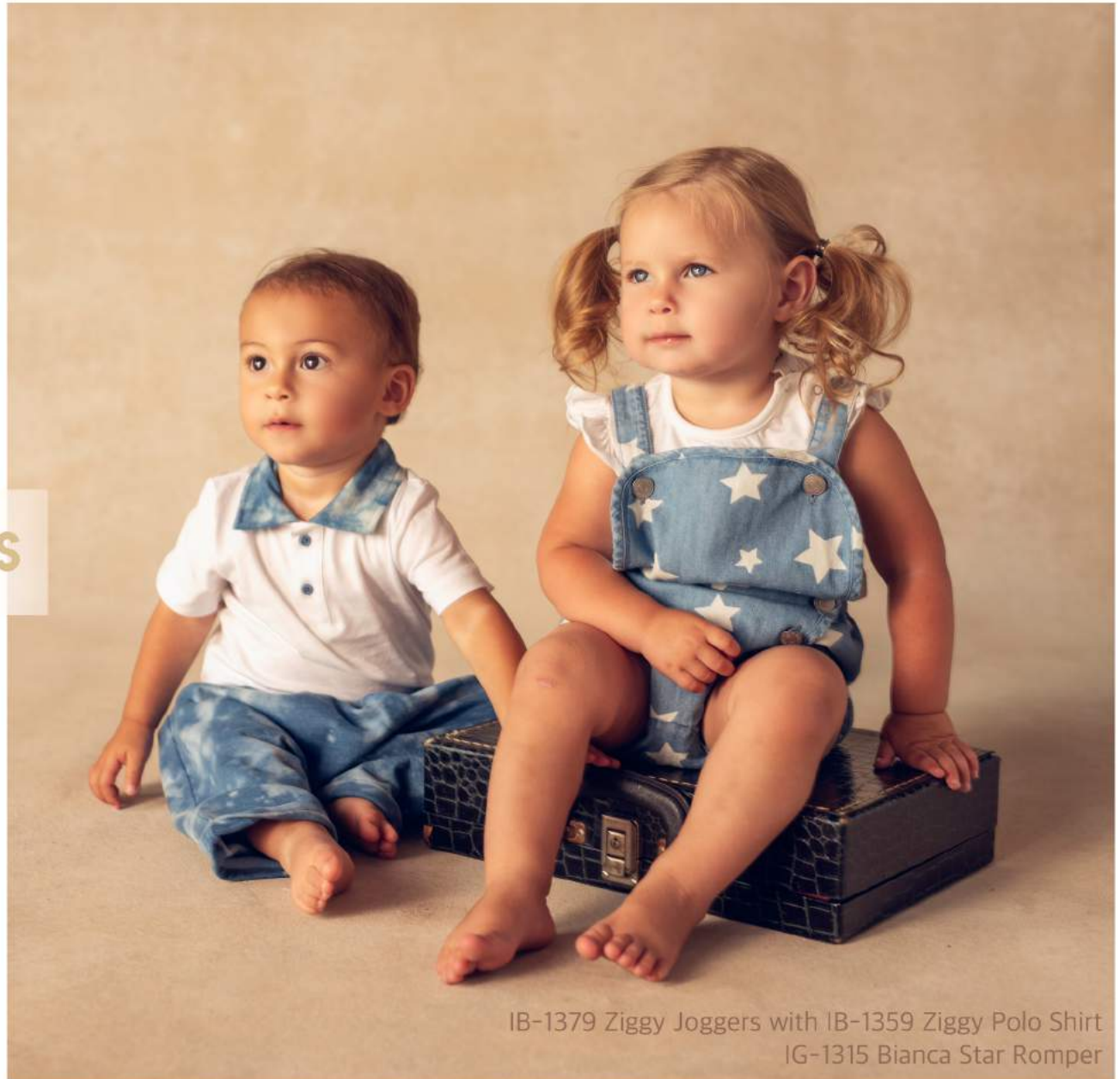
IB-1379 Ziggy Joggers with IB-1359 Ziggy Polo Shirt IG-1315 Bianca Star Romper