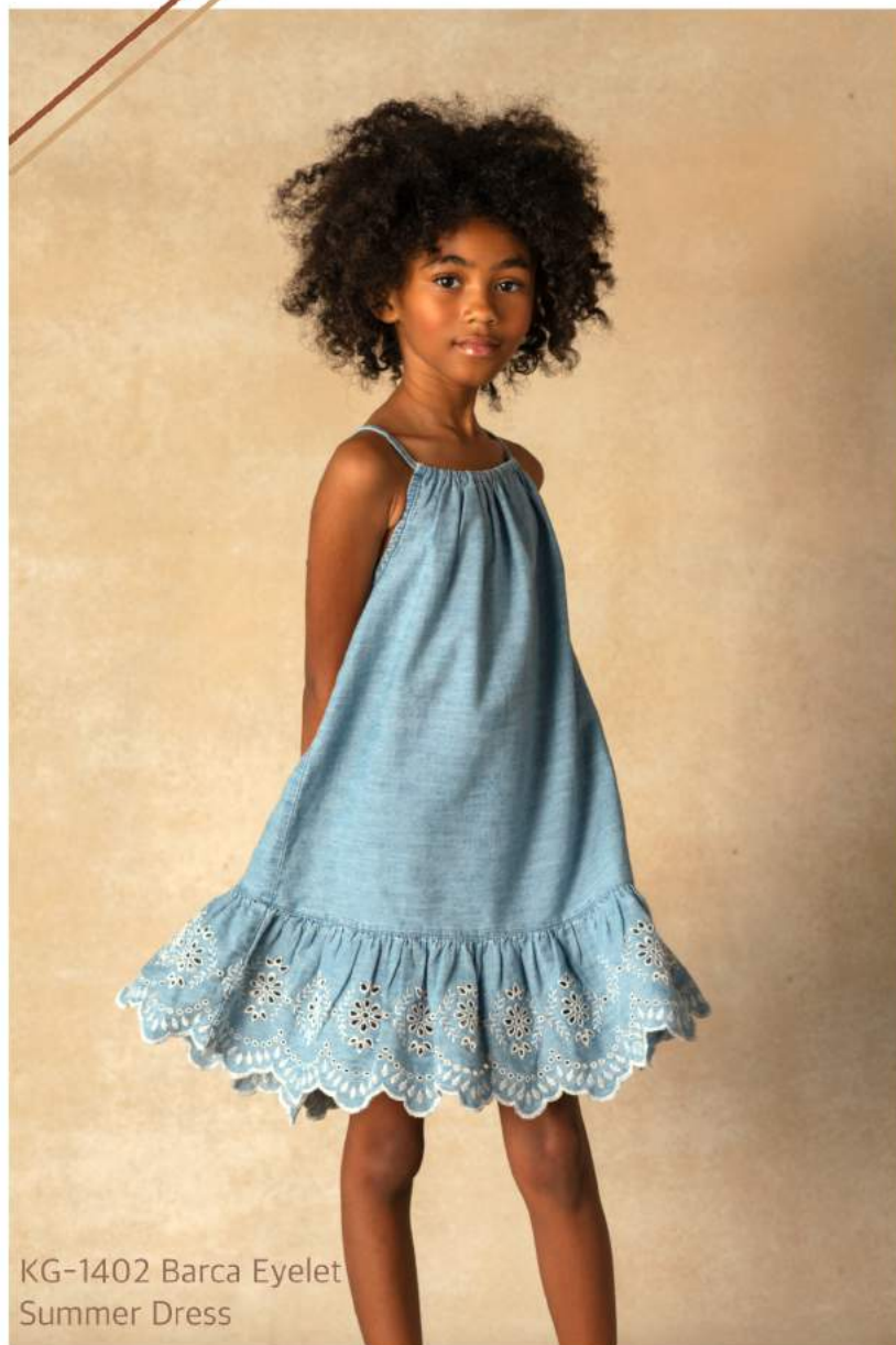
KG-1402 Barca Eyelet Summer Dress