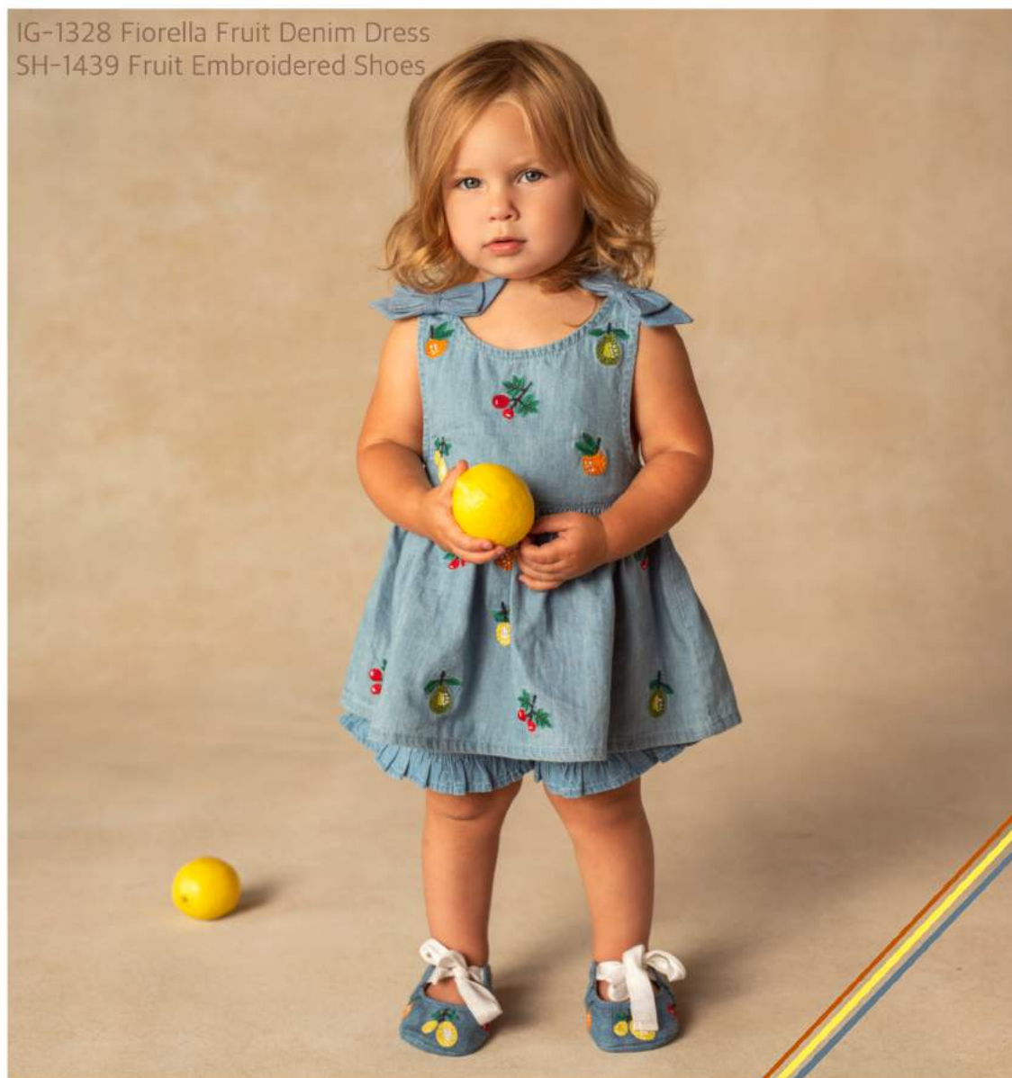
IG-1328 Fiorella Fruit Denim Dress SH-1439 Fruit Embroidered Shoes