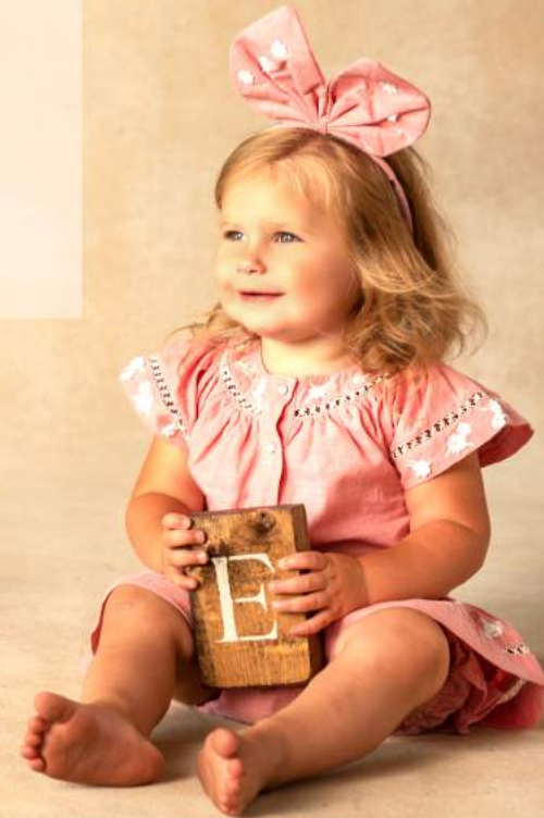
IG-1324 Poppy Chambray Dress