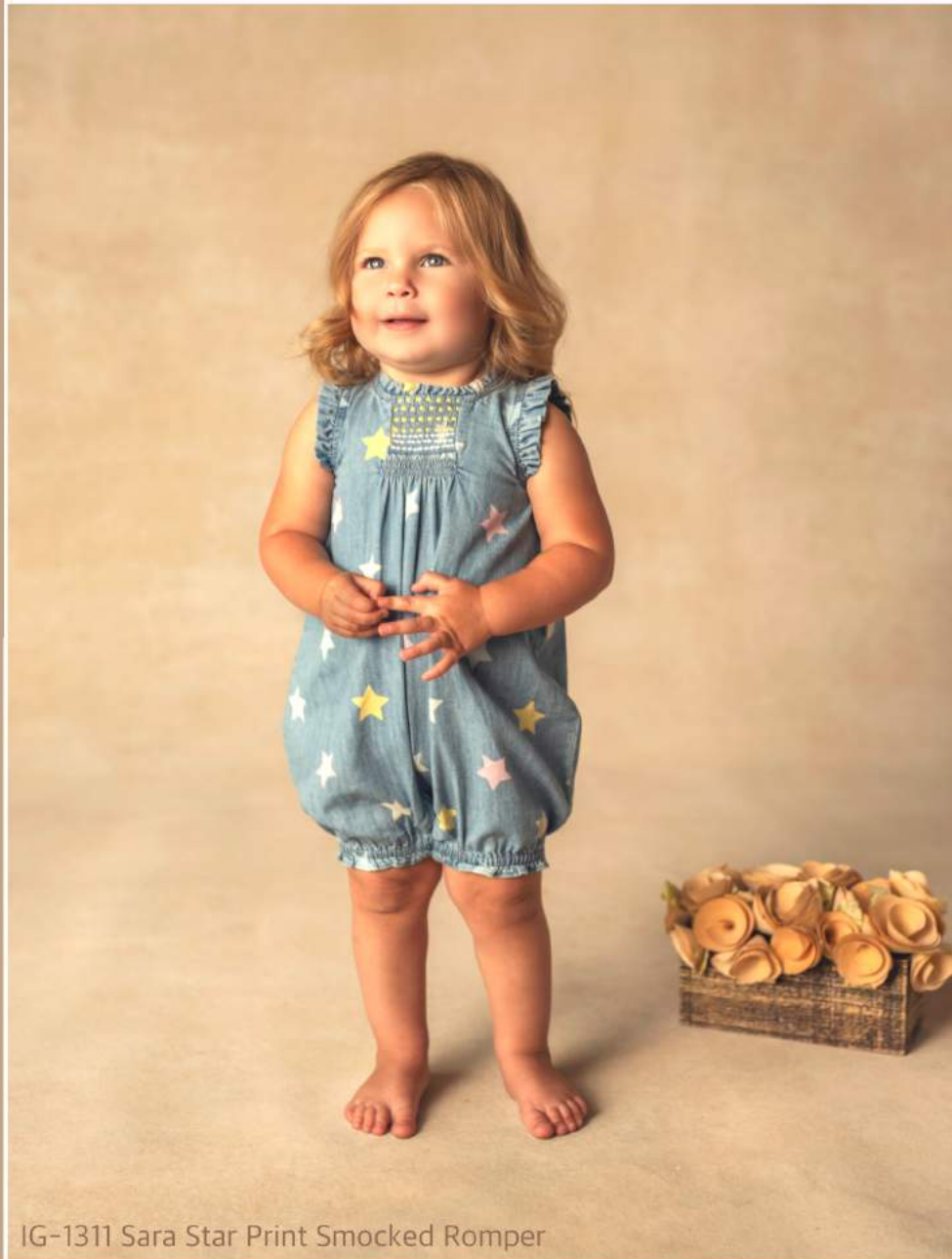
IG-1311 Sara Star Print Smocked Romper