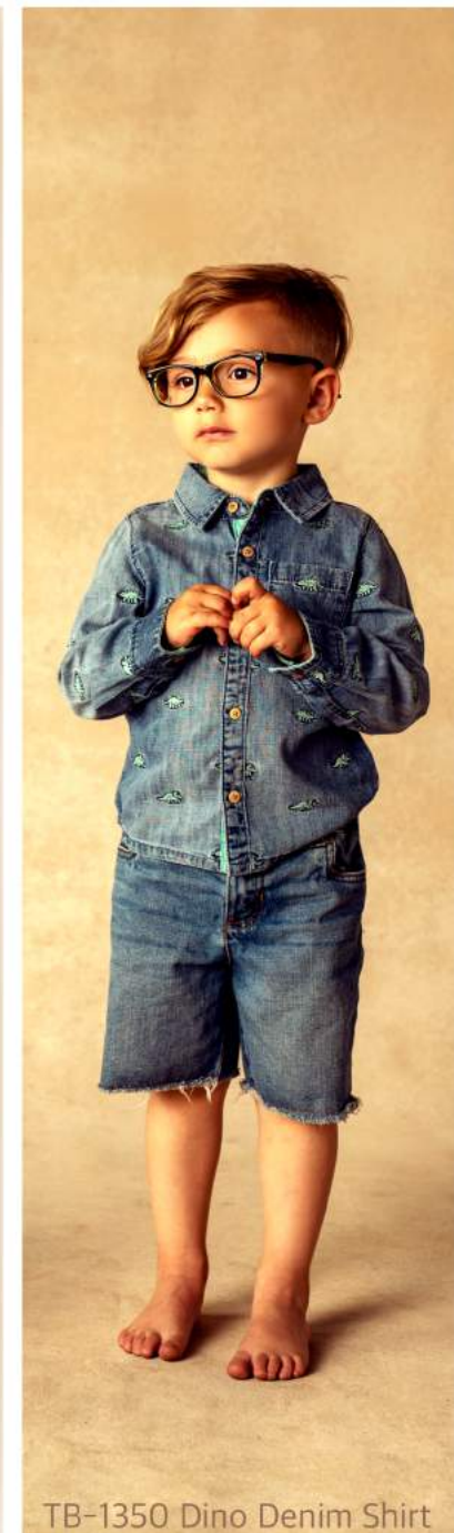
TB-1350 Dino Denim Shirt

We have refined our in house eco-friendly washing units to perform a variety of washes and special softening treatments on fabrics to make our clothes butter-soft for rich texture, long lasting color, and a comfortable feel.