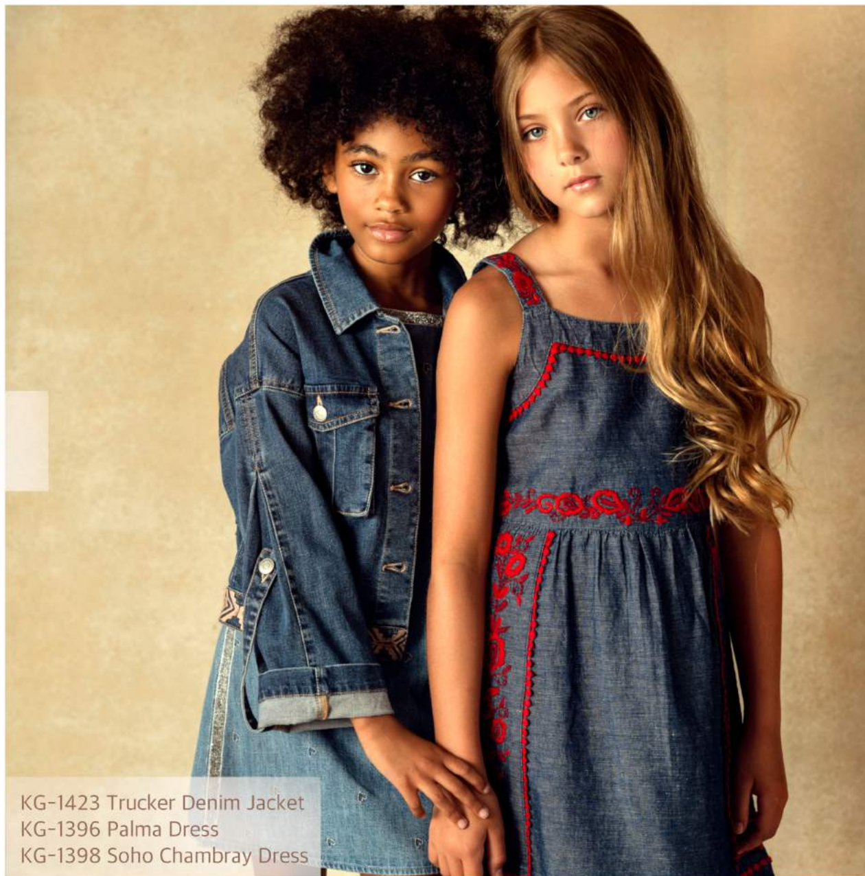
KG-1423 Trucker Denim Jacket KG-1396 Palma Dress KG-1398 Soho Chambray Dress