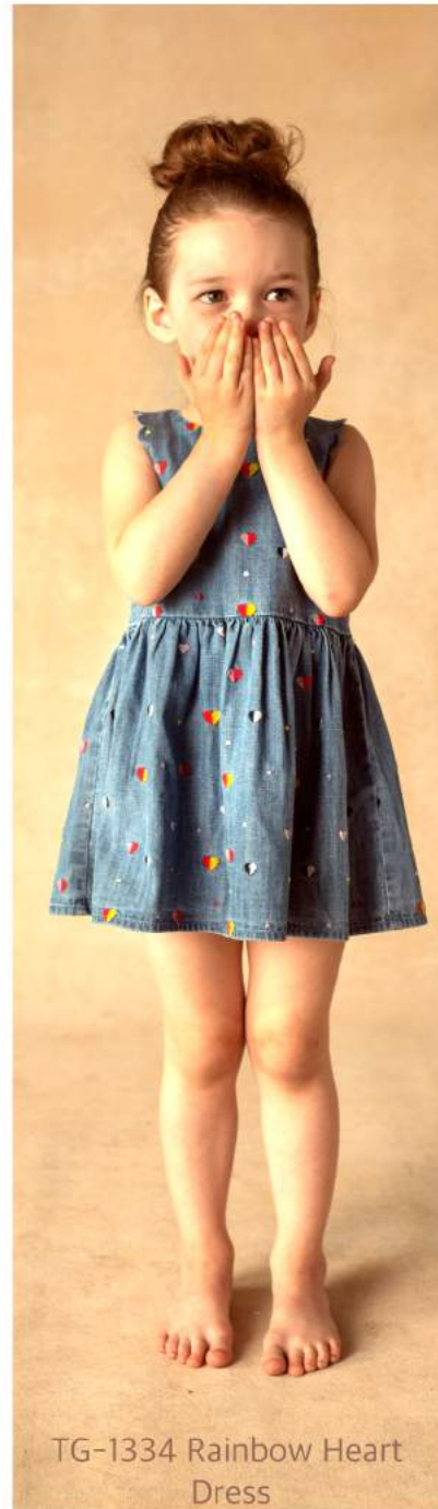
TG-1334 Rainbow Heart Dress