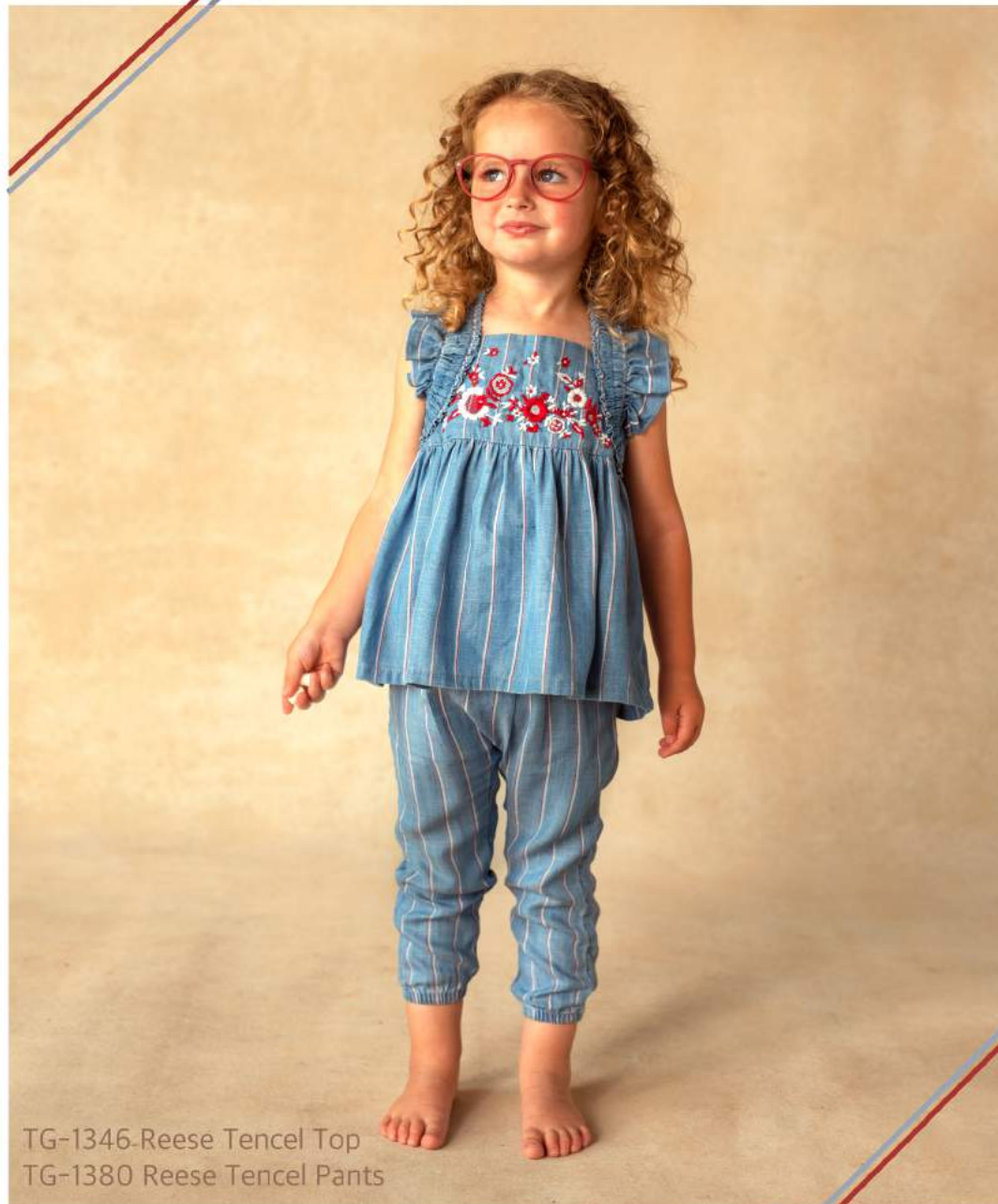
TG-1346-Reese Tencel Top TG-1380 Reese Tencel Pants