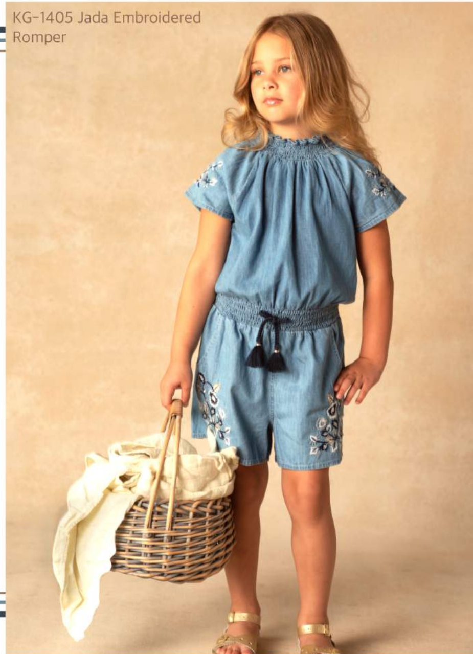
KG-1405 Jada Embroidered Romper