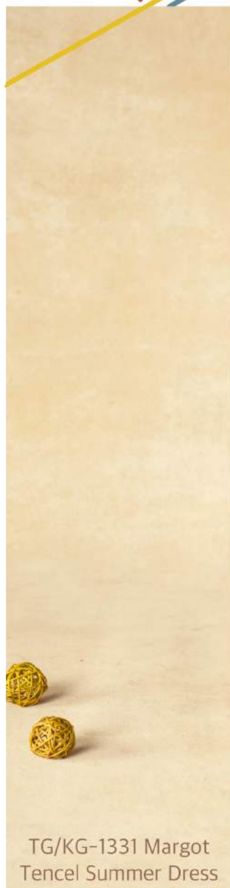
TG/KG-1331 Margot Tencel Summer Dress