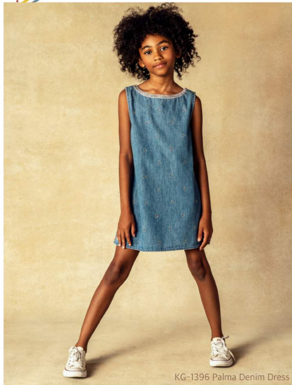
KG-1396 Palma Denim Dress