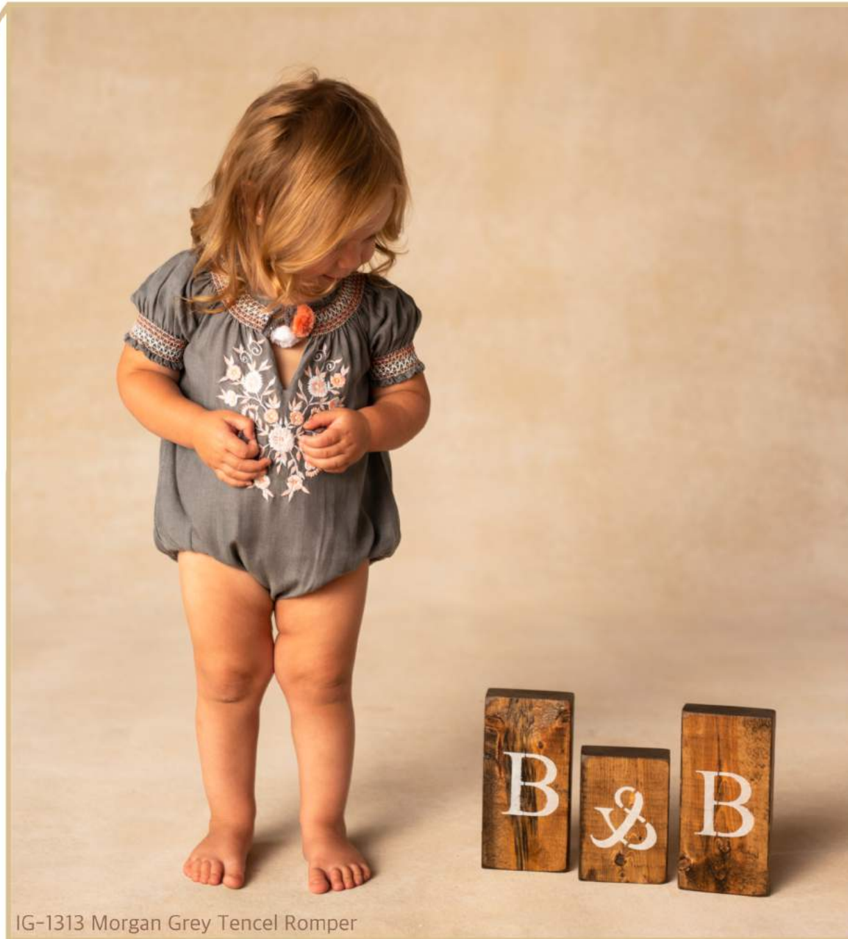
IG-1313 Morgan Grey Tencel Romper