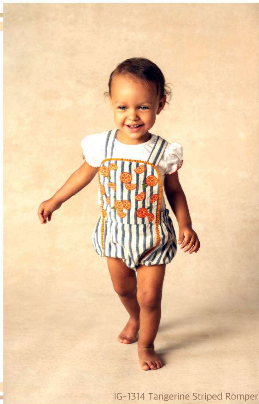
IG-1314 Tangerine Striped Romper