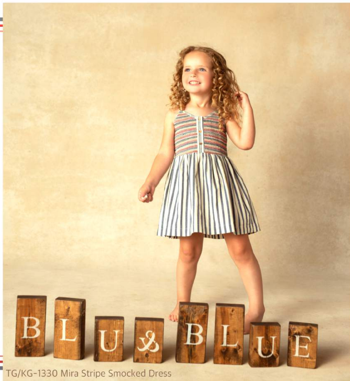
TG/KG-1330 Mira Stripe Smocked Dress