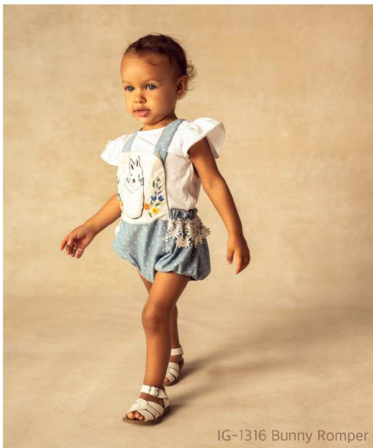
IG-1316 Bunny Romper