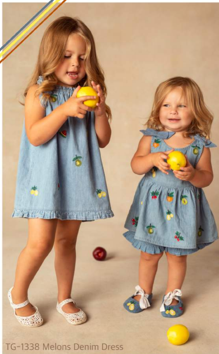
TG-1338 Melons Denim Dress