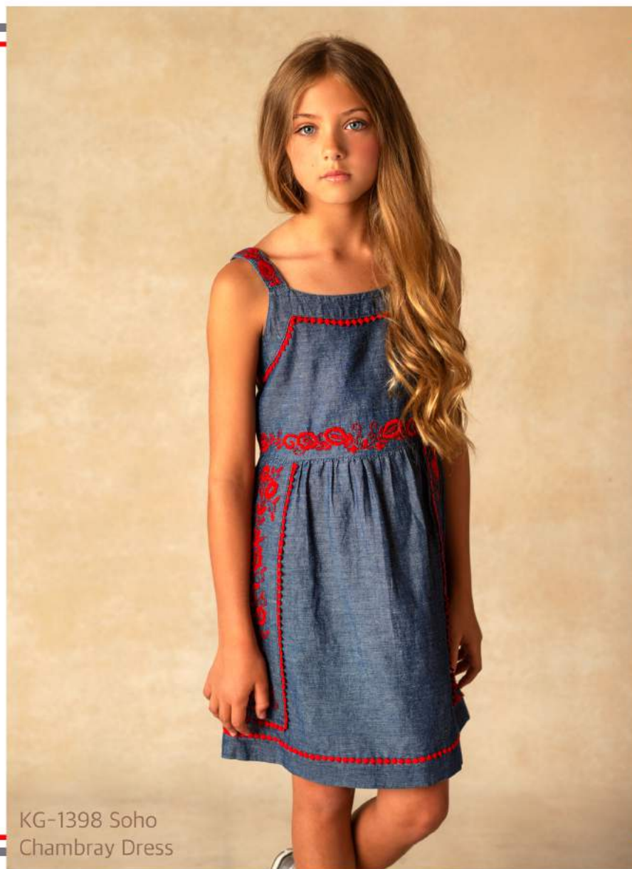
KG-1398 Soho Chambray Dress