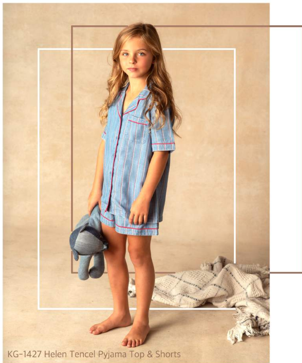
KG-1427 Helen Tencel Pyjama Top & Shorts