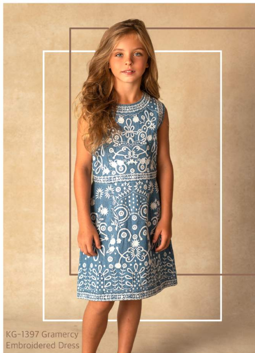
KG-1397 Gramercy Embroidered Dress