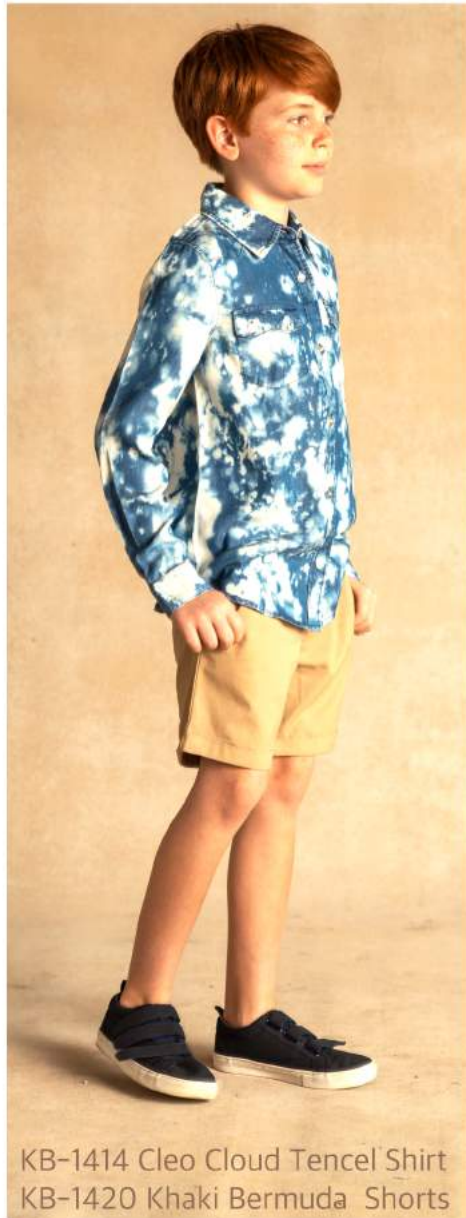
KB-1414 Cleo Cloud Tencel Shirt KB-1420 Khaki Bermuda Shorts