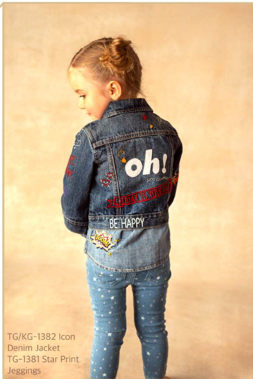
TG/KG-1382 Icon Denim Jacket TG-1381 Star Print Jeggings