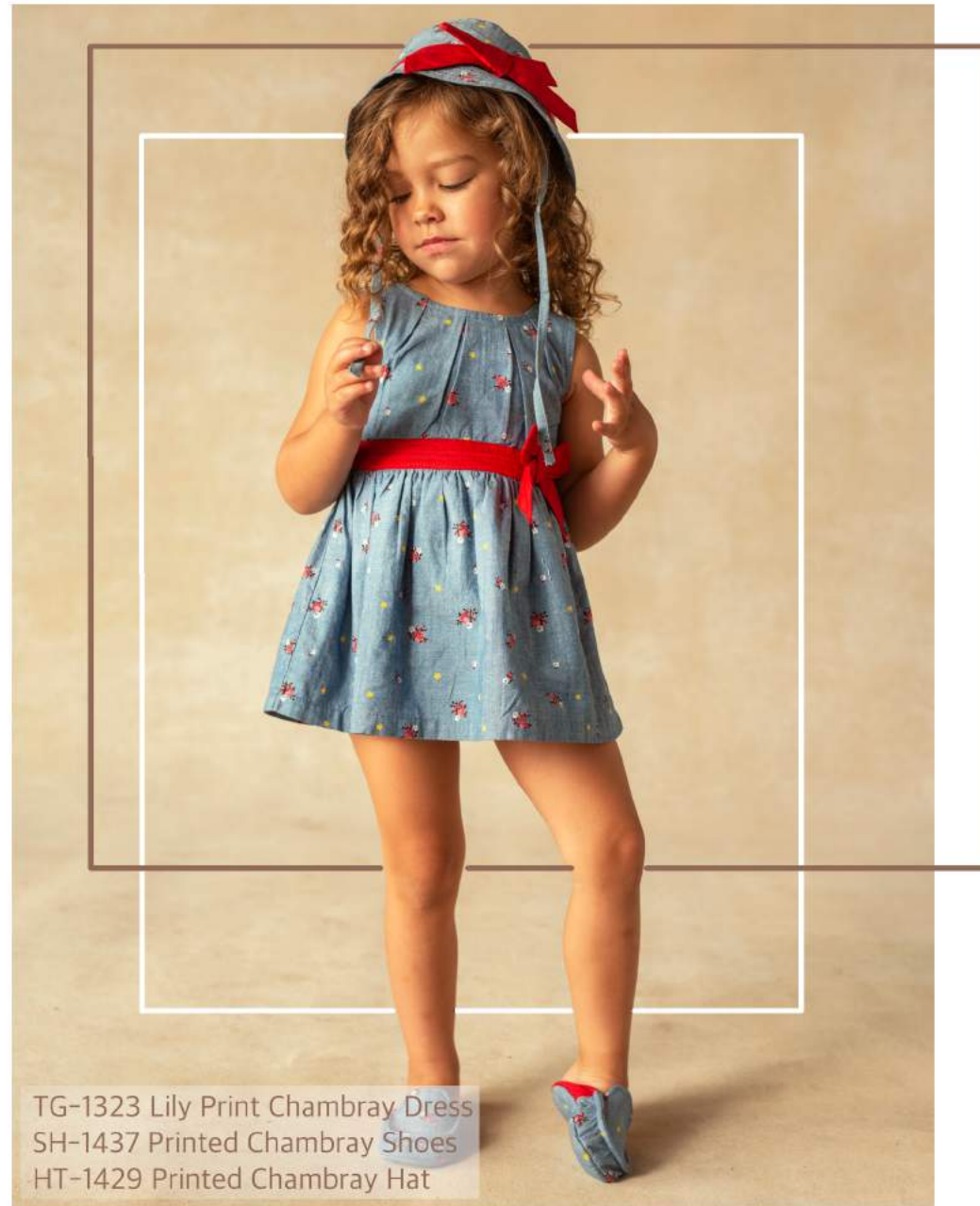
TG-1323 Lily Print Chambray Dress SH-1437 Printed Chambray Shoes HT-1429 Printed Chambray Hat