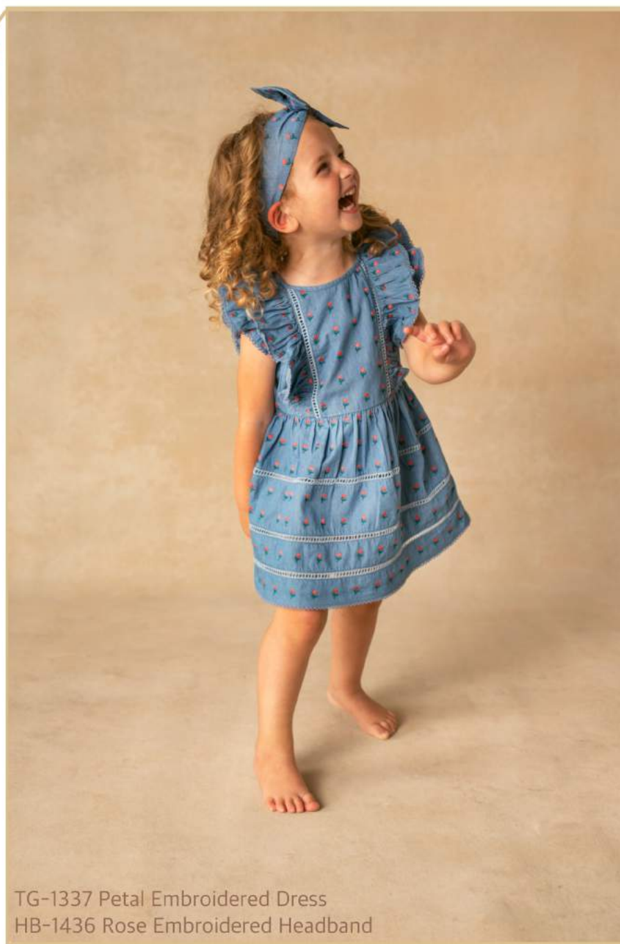
TG-1337 Petal Embroidered Dress HB-1436 Rose Embroidered Headband