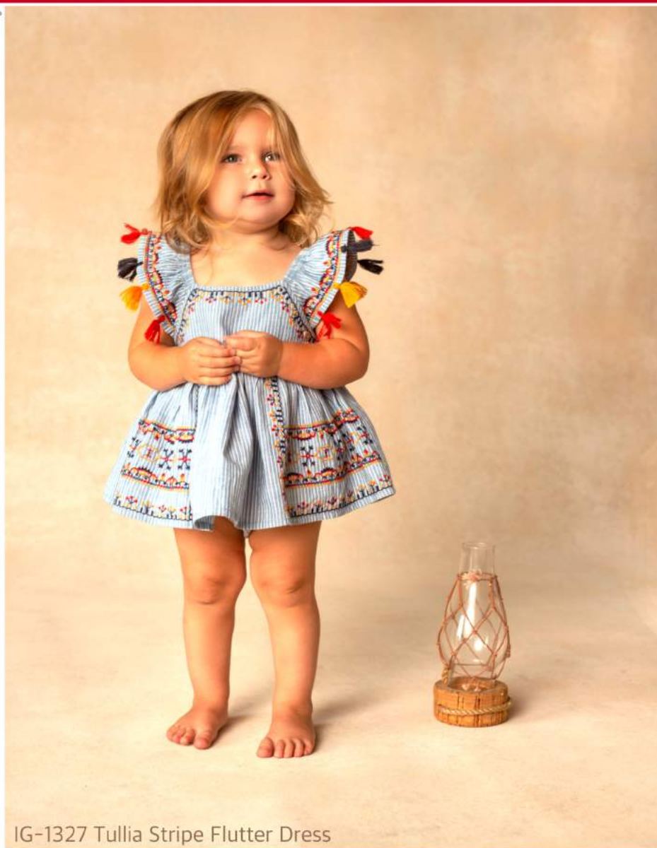
IG-1327 Tullia Stripe Flutter Dress