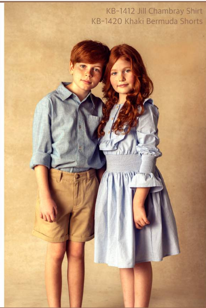
KB-1412 Jill Chambray Shirt KB-1420 Khaki Bermuda Shorts