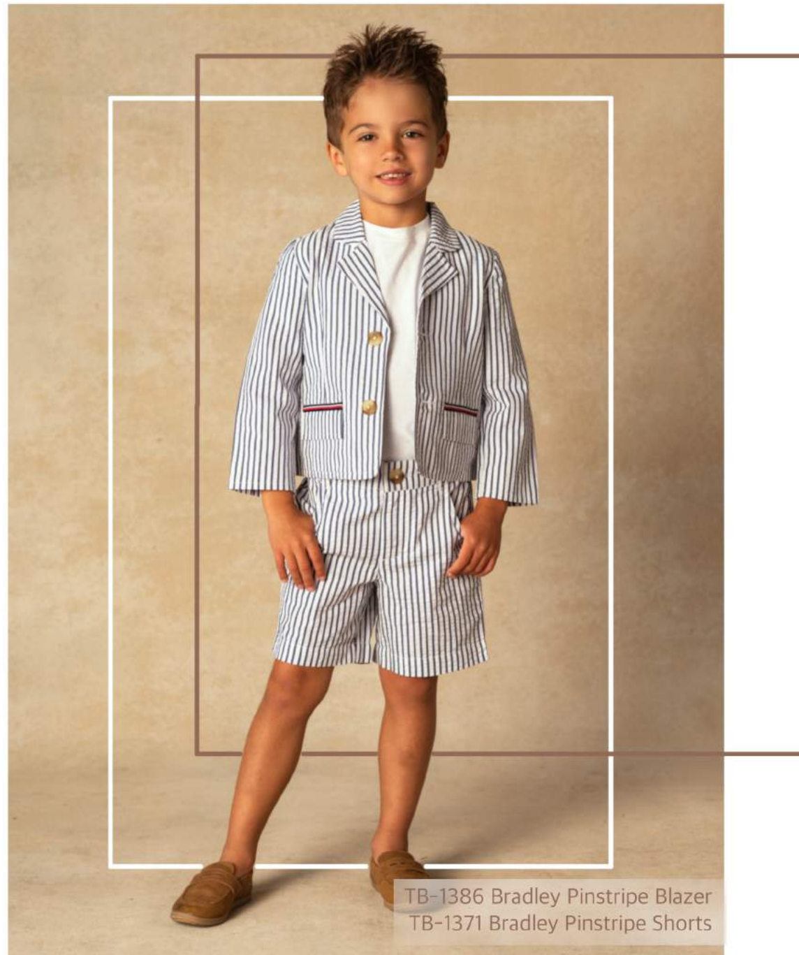
TB-1386 Bradley Pinstripe Blazer TB-1371 Bradley Pinstripe Shorts