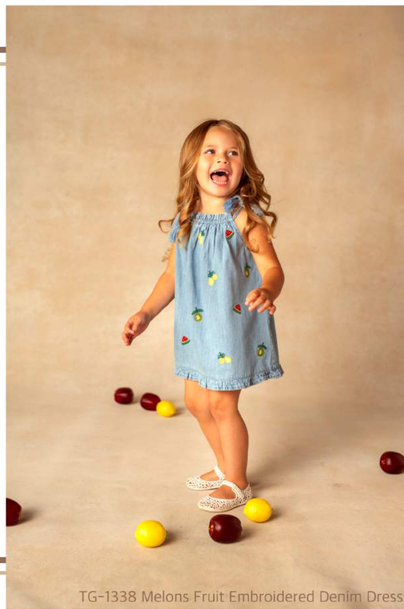
TG-1338 Melons Fruit Embroidered Denim Dress