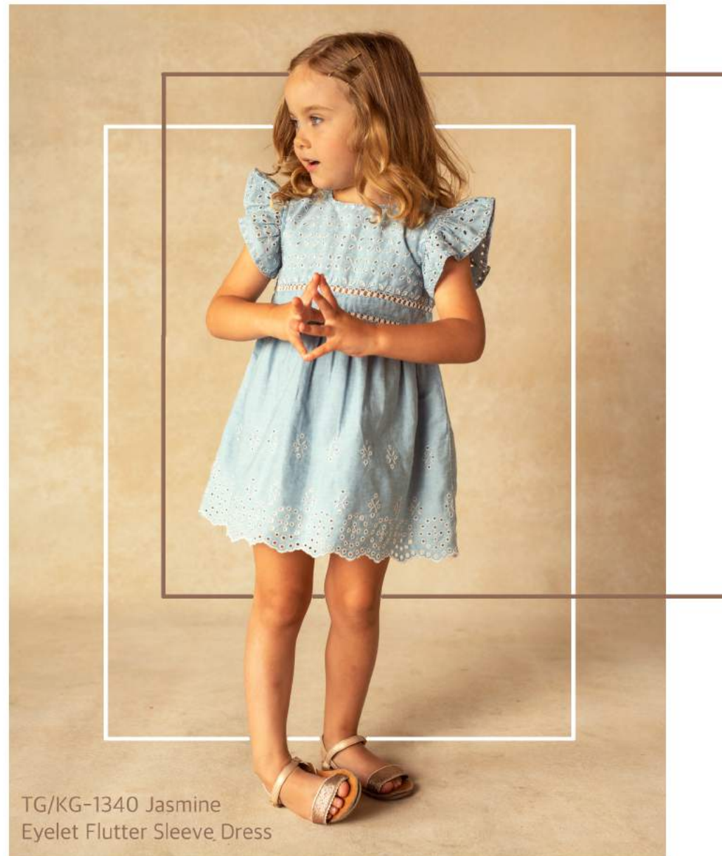
TG/KG-1340 Jasmine Eyelet Flutter Sleeve Dress