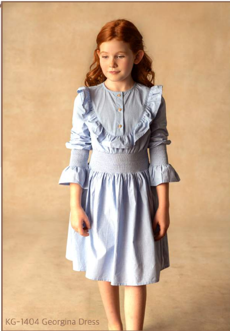
KG-1404 Georgina Dress