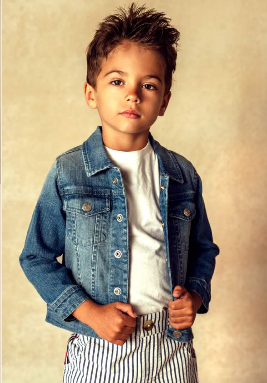
TB-1385 Neil Denim Jacket